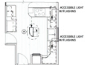
KITCHEN PLAN Scale: 1/4" = 1' - 0"