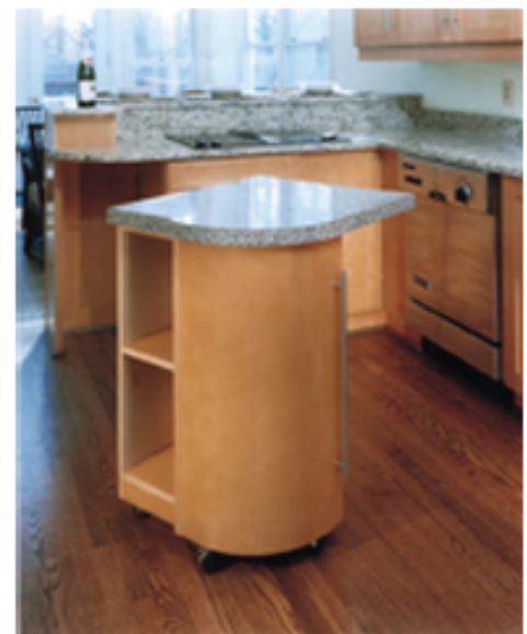
Kitchen rolling cabinet